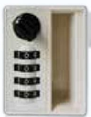
3S Keyless Lock