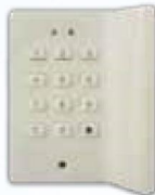
RF - 15N