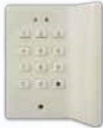
RF - 15N