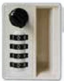
3S Keyless Lock