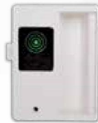
RF - 15C